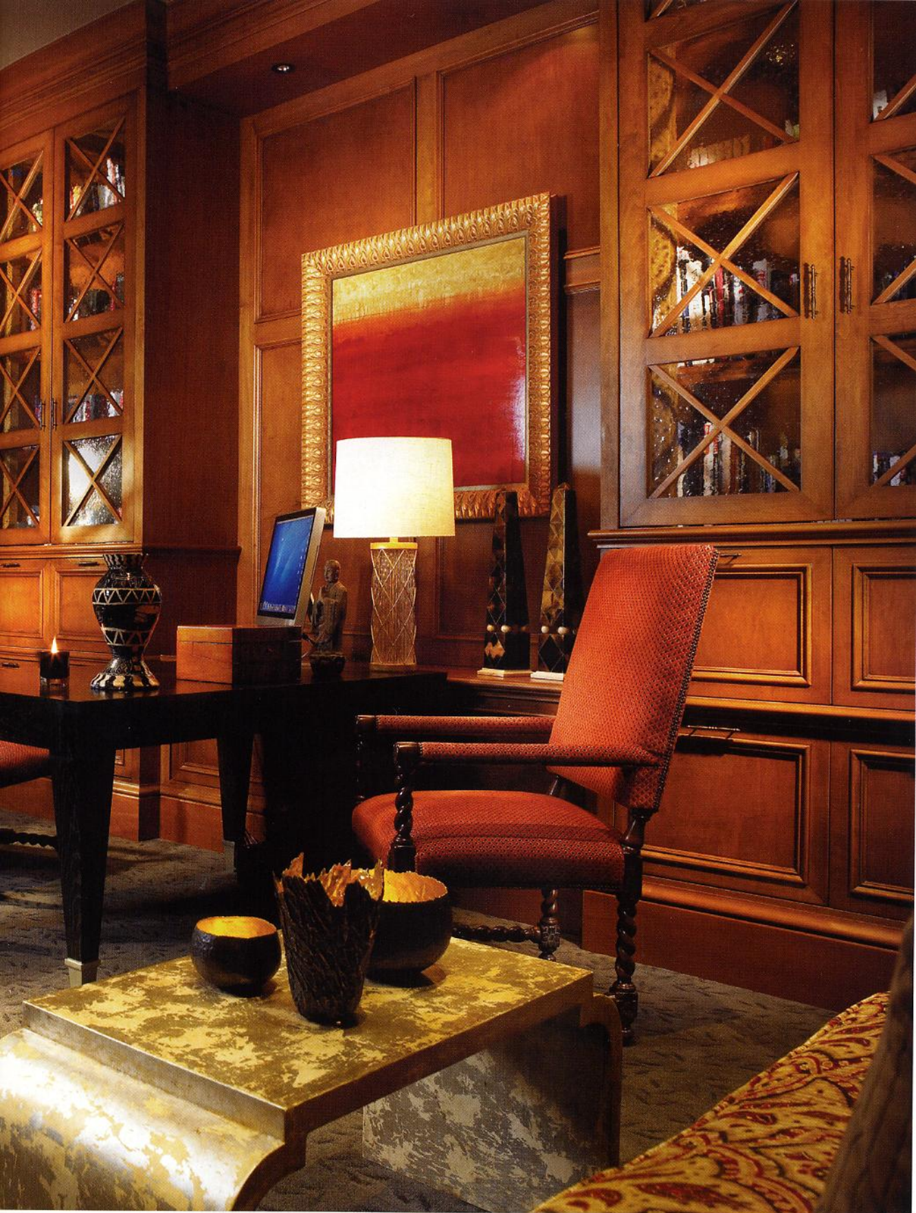
ABOVE: Oversized, comfortable seating pairs with a cocktail table from Dennis & Leen in a rubbed silver leaf finish in the husband's library. Armchairs with braided-wood legs from Panache Designs, upholstered in Scalamandr 's terra cotta-toned petite dot pattern, pull up to a writing desk from Donghia, topped by a Boyd Lighting table lamp.